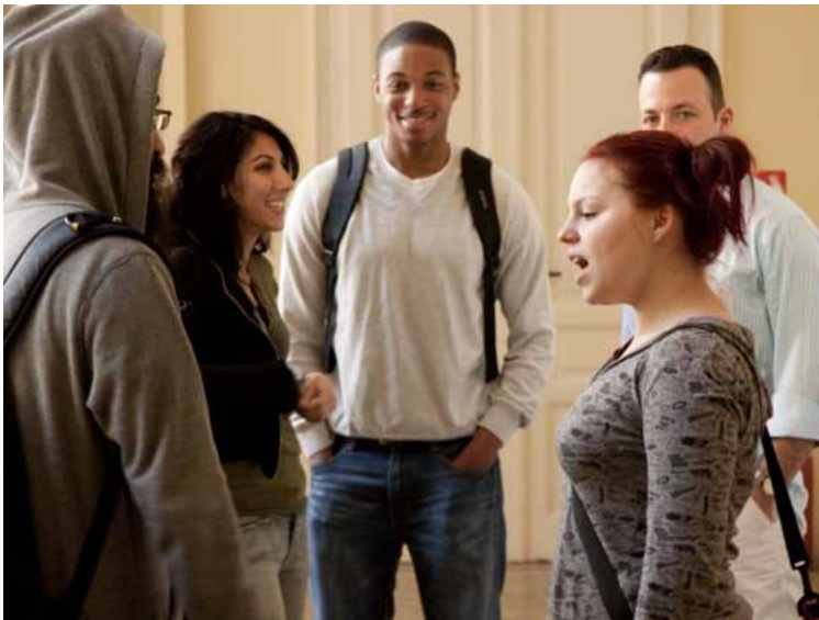
Figure 6. Students at IUC.