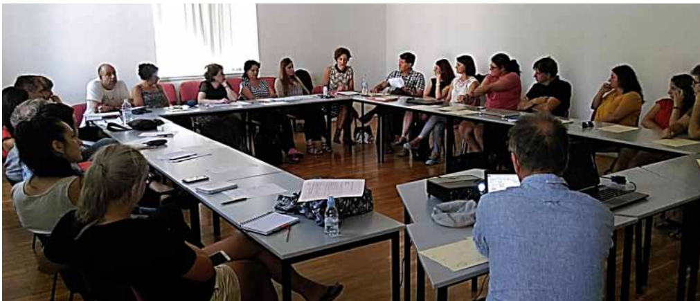
Figure 4. A typical IUC course round table.

In the IUC's history, there were a number of highly specialised seminars, but majority of courses and conferences from the very beginning tended to be interdisciplinary. Among hundreds of world-known scientists who contributed to the academic rating of the Centre were the Nobel price winners Werner Heisenberg, Linus Carl Pauling, Hannes Alfven, Joseph Rotblat, Harold Kroto; philosophers Hans Georg Gadamer, Paul Ricoeur, Jacques Derrida, Jürgen Habermas, Hans Küng, Gayatri Spivak and many others. The structure of courses is mainly round table set-up. In a relaxed atmosphere of the IUC, away from sometimes rigid or formal structures of home institutions, differences are overcome. Specialists, coming from different academic backgrounds from all corners of the world find a common language, while students and professors engage in a more open dialogue, bypassing the hierarchical structures of their every-day communication. So, the IUC becomes a place where horizons are widened and new paths are revealed.