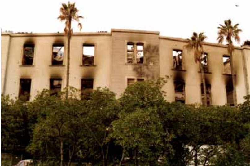
Figure 5. Burned out IUC building, December 1991.

support for the rebuilding and refurbishing of the burned building. Academic programmes needed to return to its home. Rather soon, in 1993, University of Zagreb through Croatian government ended with the reconstruction of the building and partial refurbishing. A group of German universities, HESP office in Budapest and USAID also contributed and the IUC returned to its home.