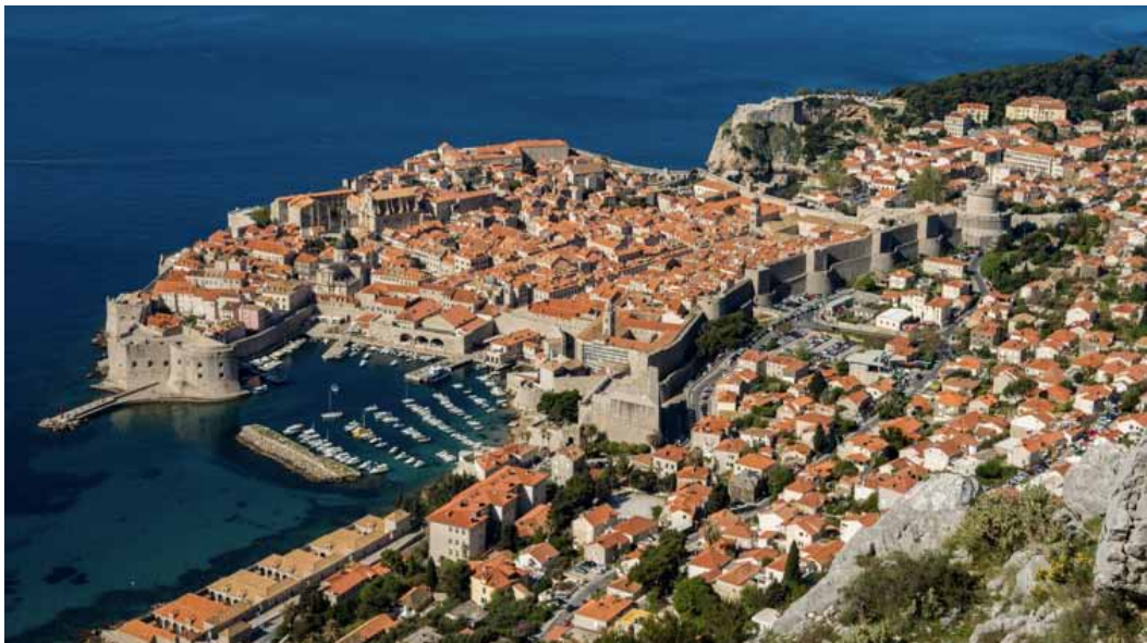
Figure 3. Dubrovnik, Croatia.

neutral posture among big forces. Due to skills of its people, nominally under the protection of Ottoman Empire, the town prospered politically and economically, cooperating successfully with North and South, East and West, within Christianity and Islam. In the same time, it governed its territory wisely, always putting public needs above private ones, tending to infrastructural projects such as sewage systems and running water, integrating within its society Jewish religious minority. As the town that cherished its freedom in the past and still lived on the bases of its tradition, Dubrovnik was considered to be the ideal ambient for contemporary scholars to exchange ideas, promote dialogue, intercultural understanding and share knowledge. Current political situation also helped. Former Yugoslavia was a non-aligned country, which allowed scientists and professors from both East and West, to meet in Dubrovnik to learn about each other and from each other. IUC served as a “breathing hole” through the Iron curtain.