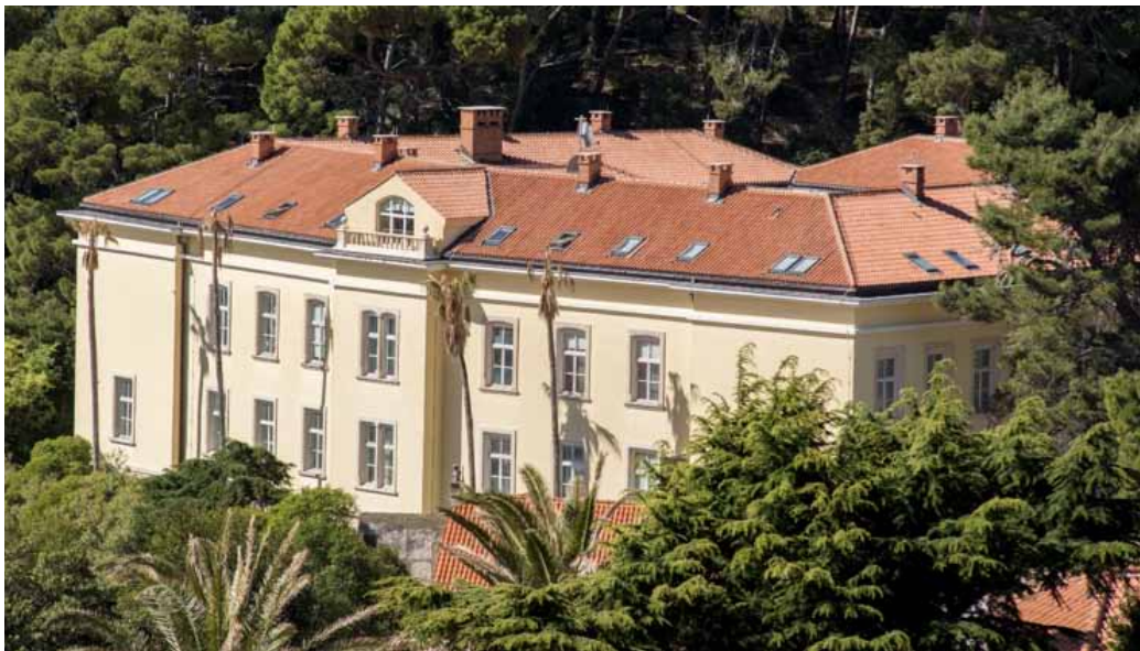
Figure 1. Building at Don Frana Bulica 4, Dubrovnik, Croatia, home of IUC.

Inter-University Centre Dubrovnik (IUC) is a specific organization. It is an autonomous, international institution for advanced studies. Established in 1972, it is structured as consortium of universities from all corners of the world. Currently approximately 170 member institutions form an IUC network. 1 The mission of the institution is promotion, organization and implementation of international cooperation in the academic community as well as network building for peaceful co-existence and pluralism regionally as well as worldwide. The mission is being implemented by organizing international graduate, post-graduate and doctoral courses, workshops and conferences in variety of academic fields. The IUC provides an open space for critical thinking and innovation, while its programmes are inter and transdisciplinary, tackling current social and academic issues. Building upon the location of its home town of Dubrovnik, Croatia, the IUC serves as a bridge between regions within Europe, European Region and the World.